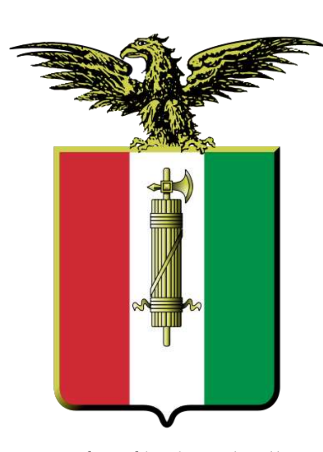
Coat of arms of the Italian Social Republic

Documents from the Salò Republic (MS 1724). Collection held at the University of Reading Special Collections Service.