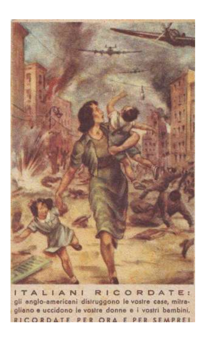
Postcard of civilians fleeing from an allied air raid from the Salò archive

One of the most interesting aspects of the collection is a small collection of anti-Allied and pro-Fascist propaganda postcards from the Ministero della cultura populare, examples of which are shown above and below.