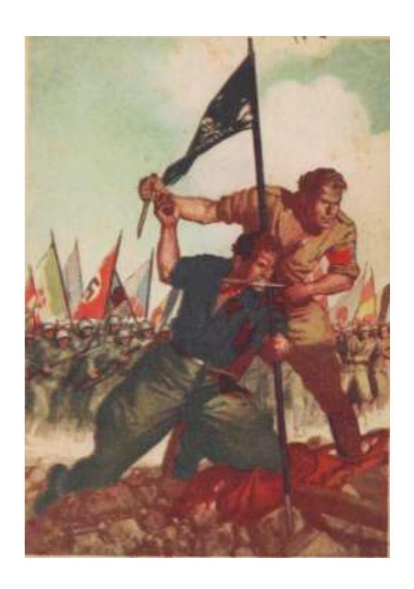
Postcard of German and Fascist troops from the Salò archive

However, although the Republic exercised official sovereignty in northern Italy, as a puppet regime it had no power and was dependent on the German military to maintain control. The German government had control of almost everything, controlling the Salò government's telephones, censoring letters and giving orders to the Republic's army and police. Although Mussolini claimed power over all of Italy, the actual boundaries of the state were those of the German-occupied zone, being the stretch of plain on either sides of the River Po. The regime relied on German rather than popular support, as the Italian people showed a preference for the resistance movement, an uprising against Nazi occupation of most of Italy, and against the Salò Republic as a regime controlled by Germany. The German forces had little respect for the Republic, and saw it as simply a means of maintaining order by repressing Italian partisans and persecuting Italian Jews.