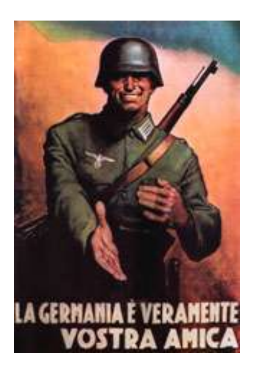
Italian propaganda poster 'Germany is truly your friend'

One of the main aims of the Republic was also to seek revenge against those who had voted against Mussolini in July 1943. These individuals included Mussolini's son-in-law, the former foreign minister Count Galeazzo Ciano, who, along with five others, was tried by a Fascist court and shot by a firing squad.